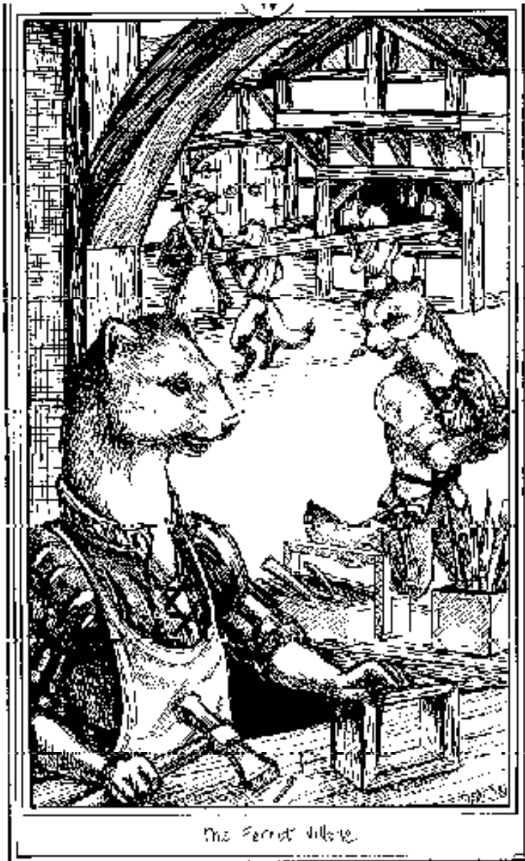
The Secret Village.