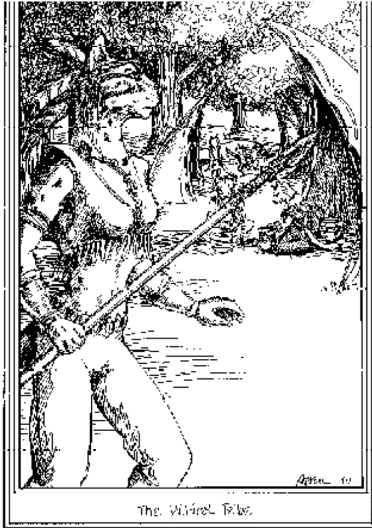
The Wildcat Tribe