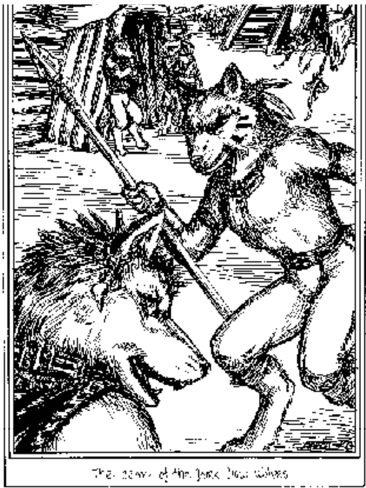
The scene of the Jack and Wolf